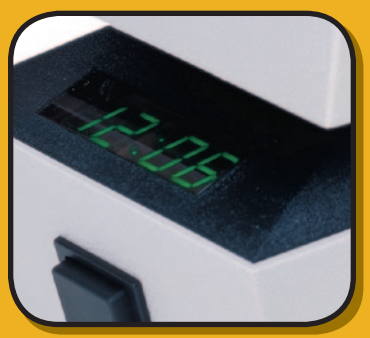
Optional Digital Display & Manual Align Push Button

The LT Series Stamps help you keep track of incoming mail, legal documents, freight bills and customer pick-ups, invoices and payments, or any other sensitive document. Without a doubt, a Lathem LT is the fastest, easiest, and most efficient way to keep up with all the "ins and outs" of your business.